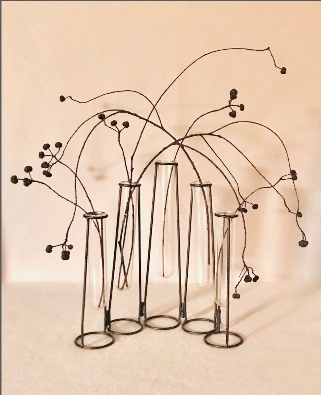
‘Three in One’